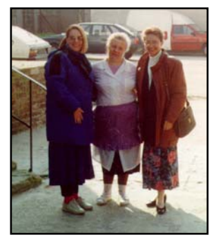
Believers in Poland have hope in Christ.

ment cancels sin, carries us into the Holy of Holies, comforts the oppressed, cries out on the mercy seat over the Law, satisfies divine justice, and closes the door to the devil. I have seen the truth of being touched by the love of the Lamb slain, of being touched by the testimony of Christ. The Holy Spirit set me in motion