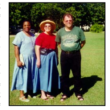
■ Mission team in Haiti

I saw God's love pouring forth for the nations. He sent me as a messenger. I remember that as I boarded Avensa flight 6001 from Miami to Caracas, Venezuela, and on to Santo Domingo, I wondered why I would ever leave the comforts of my living room to go to some remote area, not as a tourist, but as a missionary/evangelist. "I