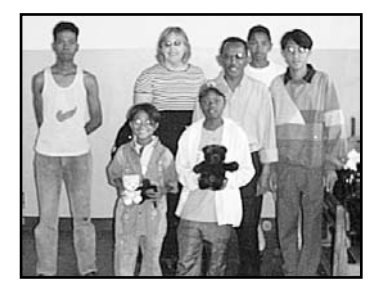
■ Orphanage in Madagascar

I have worn out several suitcases now, and that is real-