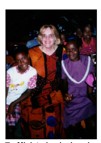
Ministering in Jamaica

In the wartorn nation of Poland, I saw God work in a people daring to hope, believe, and cling to faith in God. They are overcomers in spite of their suffer-