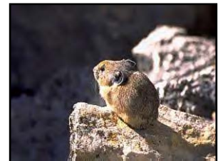
■ The Cony

"She (the eagle) dwells and abides on the rock, upon the crag of the rock, and the strong place."