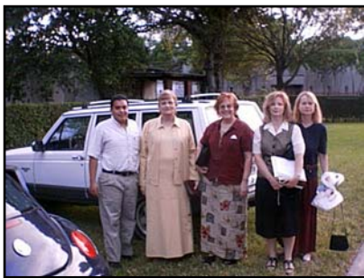
■ Ministry to local Haitian Church

media outreach worldwide and has resulted in much fruit for the Lord, as many of you can attest. People contact us, email, visit Craighouse, and even