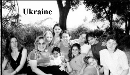
MCM going to the nations.