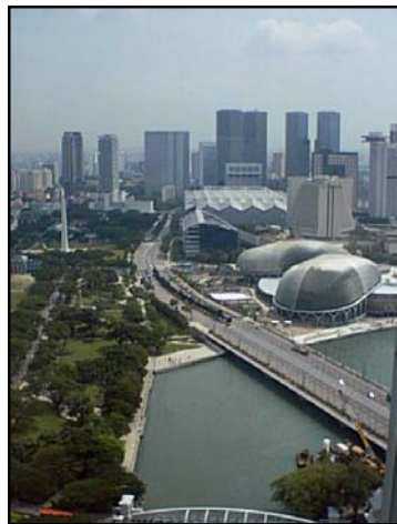
■ View of Singapore from Su Mein's office