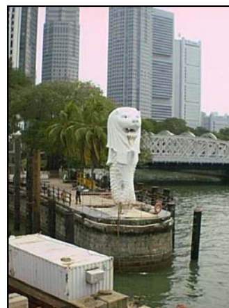
■ The "Merlion" at the Gateway to Asia