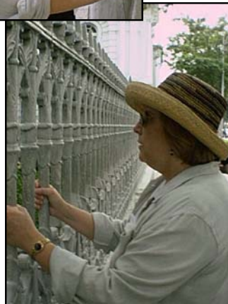
■ Intercessors at prayer

who are powerless and oppressed, and that God will encourage the people and churches in Singapore to protect the "gateway" to Asia. Pray also for special wisdom and protection for our hosts, the Thios.